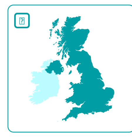
A Permanent Resident of the United Kingdom

This insurance has been specifically designed to provide insurance protection for your gadget . The policy meets the demands and needs of individuals who must be: